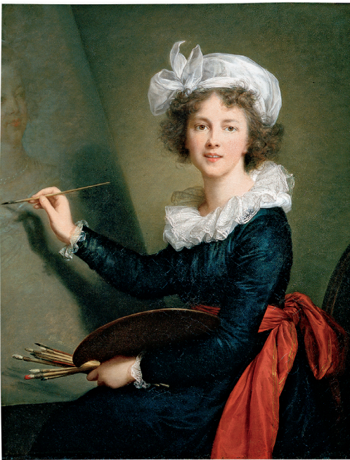
Self-Portrait, 1790, by Elisabeth Louise Vigée Le Brun, oil on canvas. Galleria degli Uffizi, Corridoio Vasariano, Florence

Curatorial Talks are available on the Intranet. Look for this one in the days after February 9.